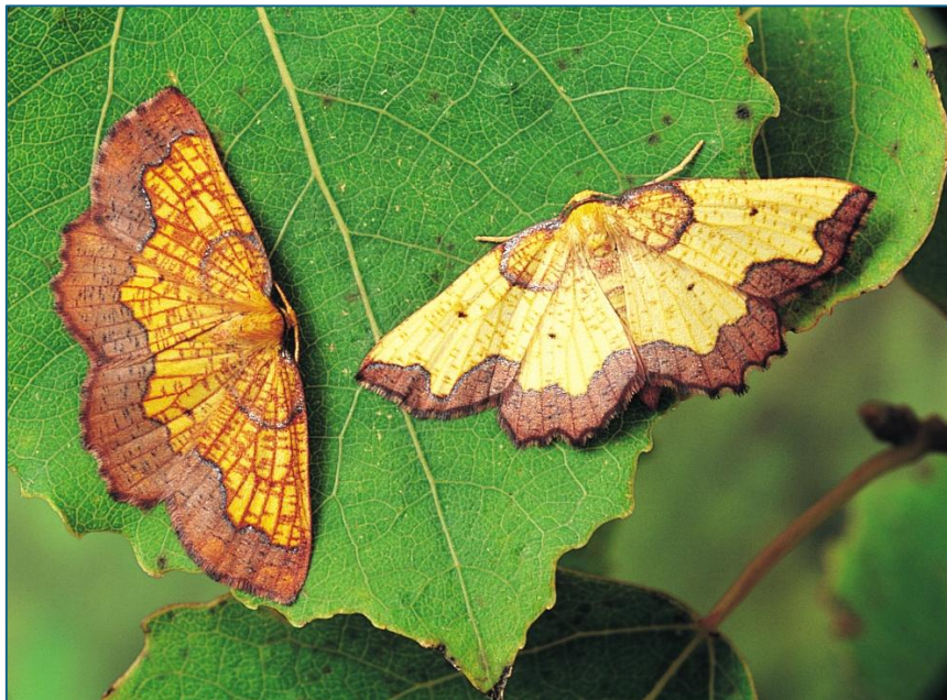
Dark Bordered Beauty, Roy Leverton

We also hosted a webinar during the campaign period that linked to the appeal theme of the Dark Bordered Beauty. The webinar reached the 1,000 limit very quickly, with well over 500 attending on the evening. The webinar is available to watch now on the BC YouTube channel .